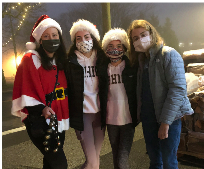
The Dunlap Crew!